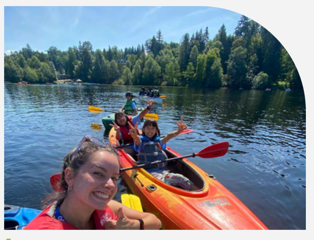
Full Day Excursions

Outings and Activities are designed to help our students to be themselves, explore their passions, and learn something new, all while having fun! GC Camp immerse students in adventures and cultural activities within BC's beautiful natural landscape.